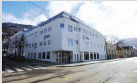
Innbyggerservice, Kaigaten 4.

Sura inyubako ya servise iri kuri Kaigaten 4, aharebana na Byparken , cyangwa hamagara kuri 55 56 55 56 .